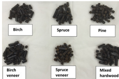
Fig. 4: The pellets which were made of different wood species.

The quality results of torrefied pellets are presented in the Tab. 7. The enclosed table shows that the MC of pellets varied between 4.4 – 8.6 %. The bulk density of all pellets was close to 700 kg.m -3 . Spruce veneer had the lowest bulk density 649 kg.m -3 .